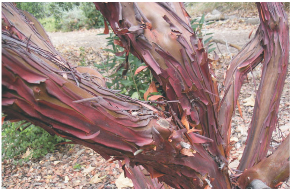
Arctostaphylos refugioensis with beautiful rich colored bark.