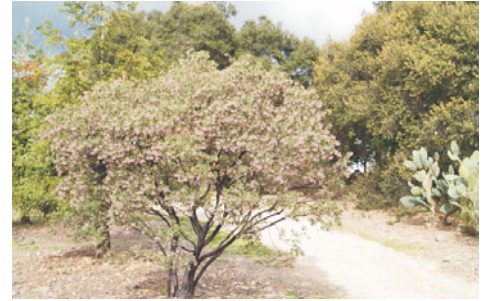
Arctostaphylos 'Louis Edmunds'

In formal applications, Manzanita makes an excellent foundation plant, one which should be used much more frequently in landscapes throughout the state.